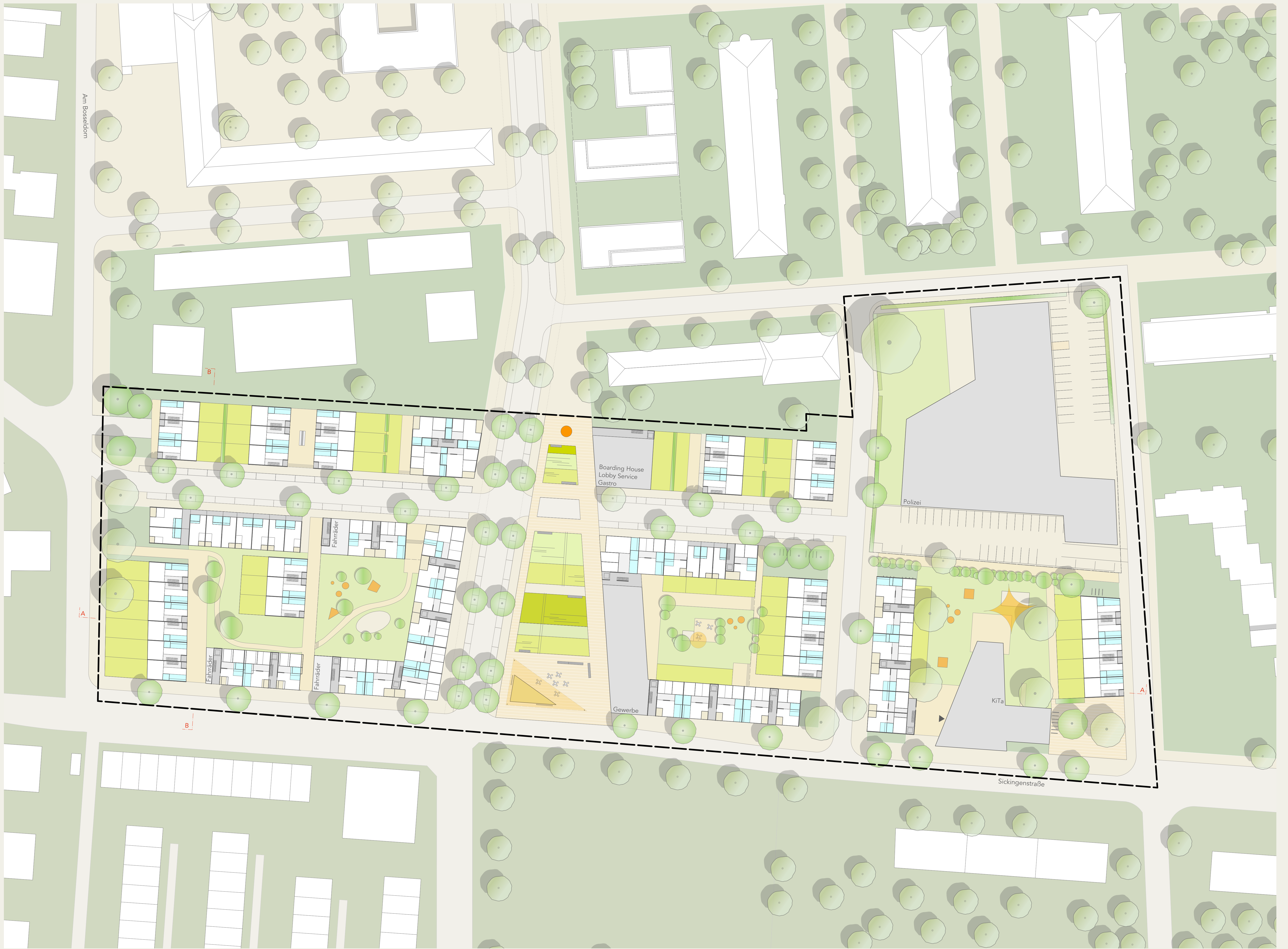
LAGEPLAN M 1:500