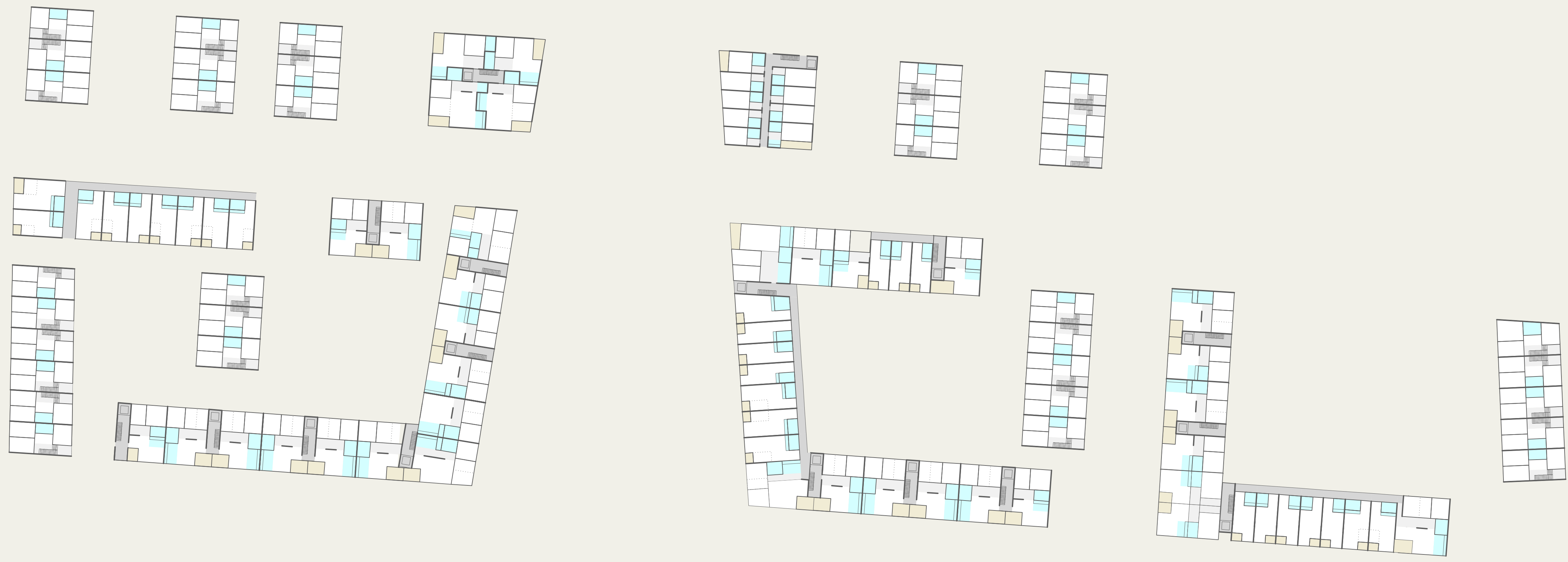
GRUNDRISS RG M 1:500